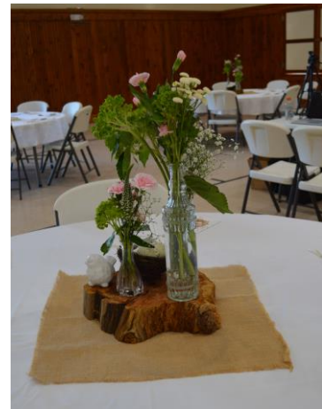
Table Centerpieces from Marlboro Friends