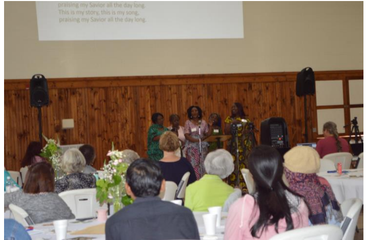
Baltimore Ladies with morning music