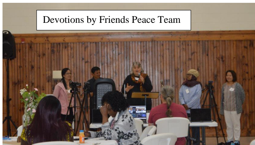
Devotions by Friends Peace Team